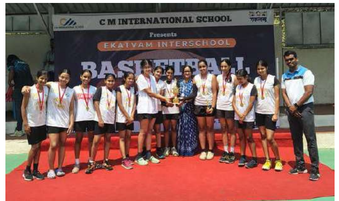
U-14 Girls' Basketball Team