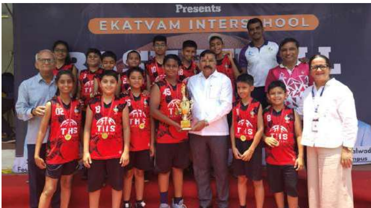
U-12 Boys' Basketball Team

May you all reach the pinnacle of success, and take the school to its deserving heights.