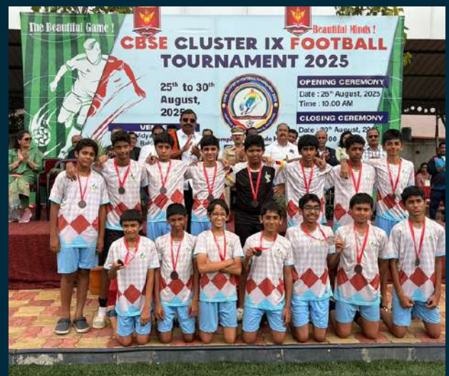
THE U-14 BOYS' TEAM