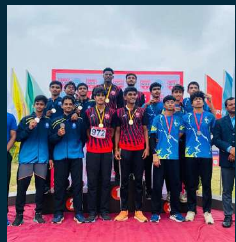
4 X 100 M BOYS' TEAM