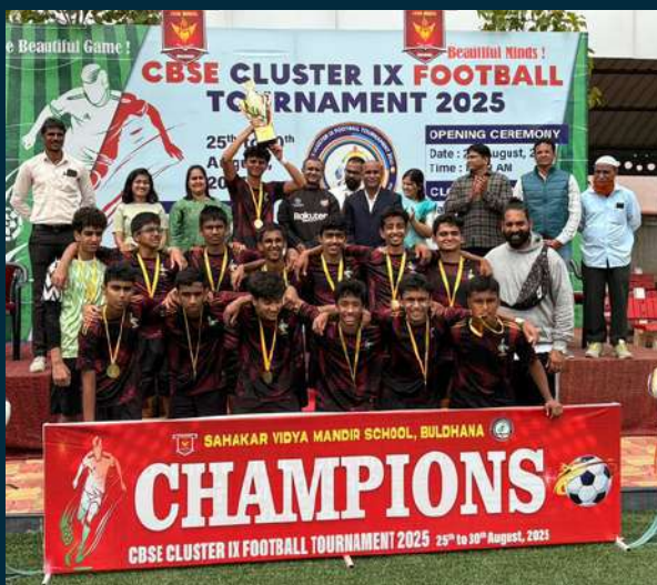
THE U-17 BOYS' TEAM

The U-14 TKS Football Team secured the 3rd Place in the CBSE State Level Cluster Tournament. It was conducted from 26 th to 30 th of August, at Sahakar Vidyamandir School, Baldhana. At the same Tournament, our U-17 team were crowned Winners. They have qualified for the Nationals level, which is going to be held in Bhopal, MP. It is indeed a proud moment, and we wish to see the boys come home with more jewels in their crowns.