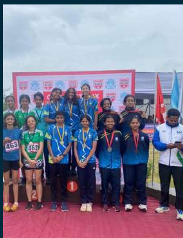
4 X 100 M GIRLS' TEAM