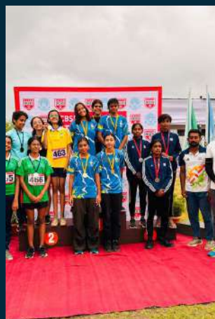
4 X 400 M GIRLS' TEAM