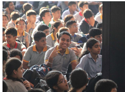
A student having a great time during the Welcome Assembly